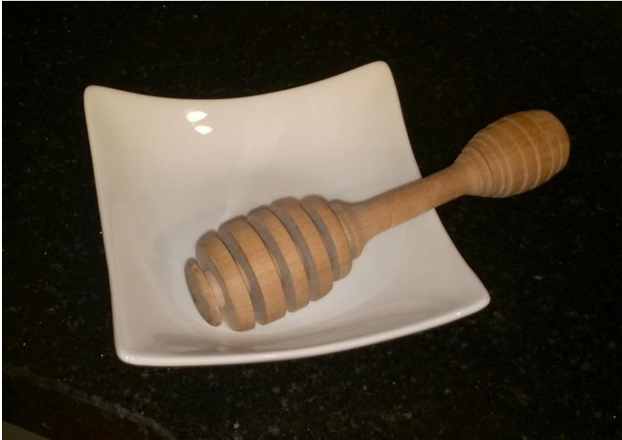
Honey dipper in beech