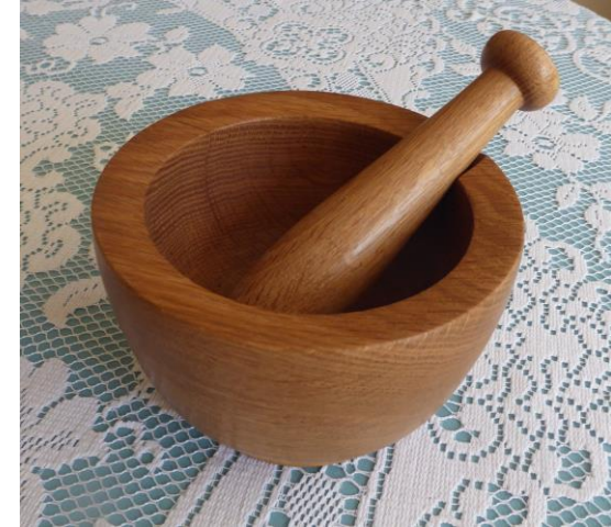
Mortar and Pestle in Oak