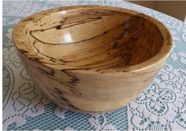
Spalted hornbeam bowl finished in food safe oil