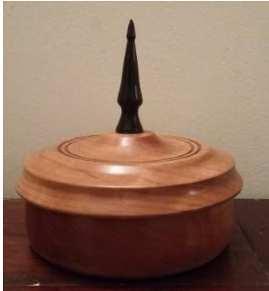
Ring box in beech