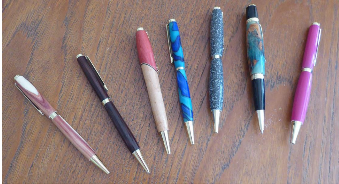
Pens in (from the left) lilacwood, rosewood, birds eye maple, resin, Corian, resin with embedded bark and another Corian