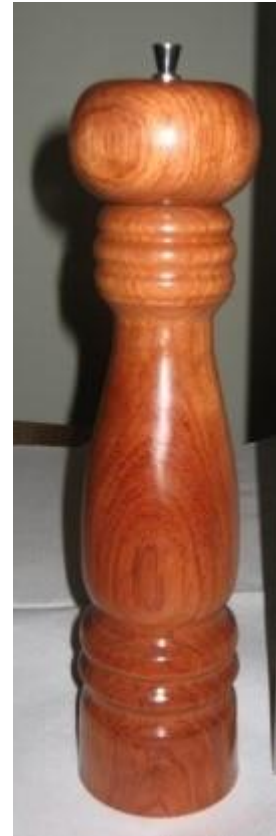
Pepper pot in bubinga