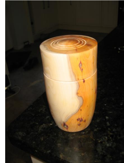
Lidded jar in Yew