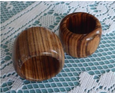
Napkin rings in zebrawood