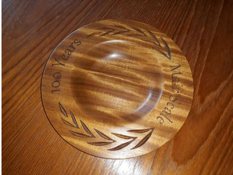
Platter in walnut. Edge engraved using CNC router and V router bit