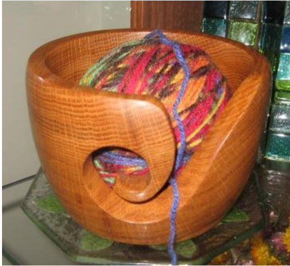
Yarn bowl in oak – oiled and waxed