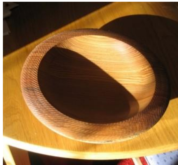
Large platter in ash