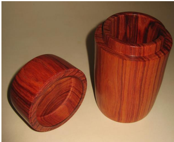
Small lidded vase in zebrawood