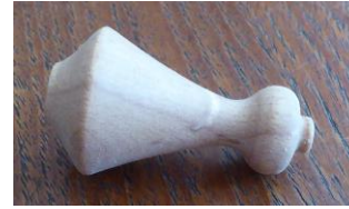
Light pull in ash