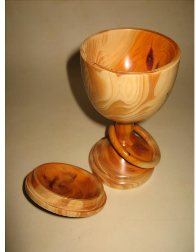
Ringed and lidded goblet in Yew