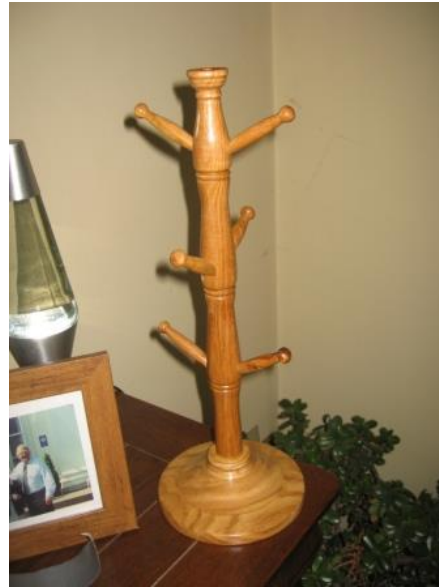
Mug tree in oak