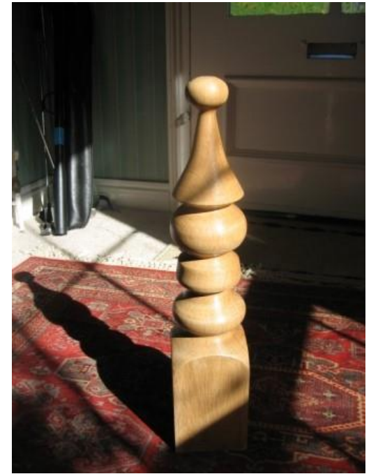
Replacement finial for garage roof in oak