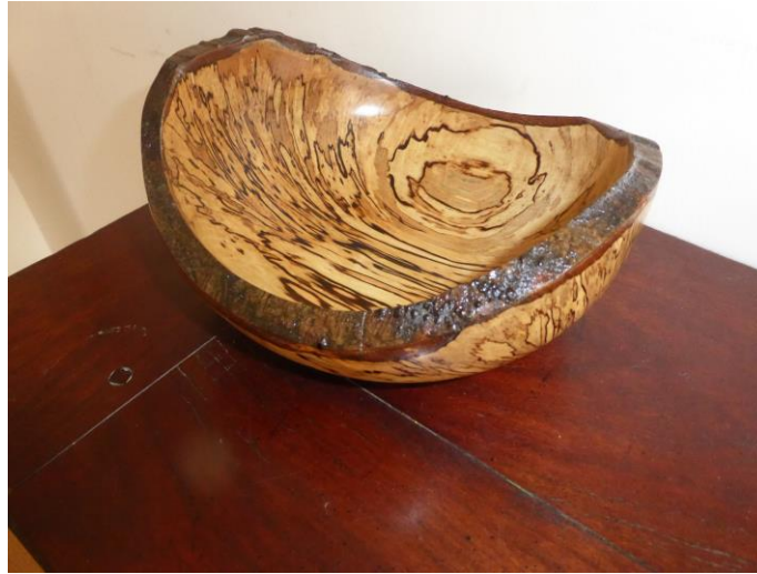
Natural edged bowl in spalted hornbeam