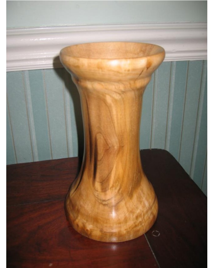
Birch vase finished in beeswax