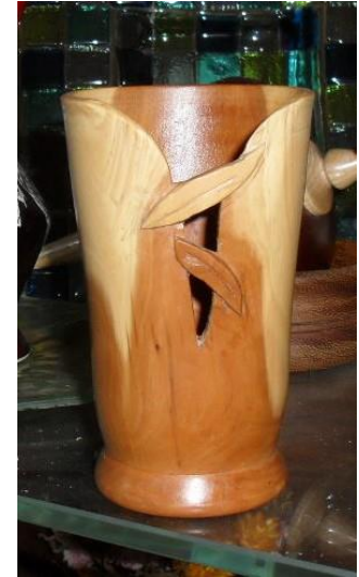
Carved jar in Yew