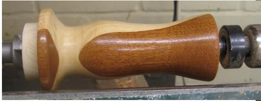
Pen holder in maple and beech