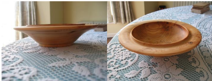
Bowl in yew showing ogee curved sides